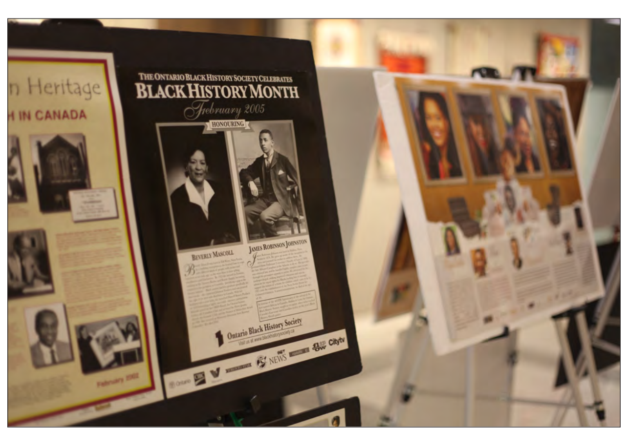
A poster celebrating Black History Month features a Glimpse of Black Life in Victorian Toronto exhibition at Etobicoke Civic Centre Art Gallery.

One of the city's main Black History Month events is an exhibition called "Black Women in Leadership," which is on display right now and